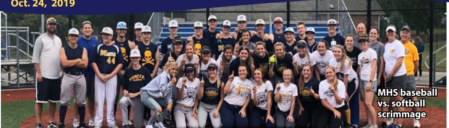
MHS baseball vs. softball scrimmage