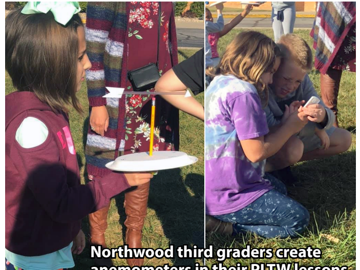
Northwood third graders create anemometers in their PLTW lessons.