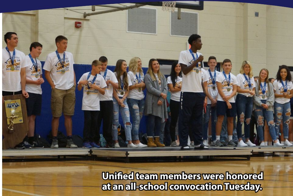
Unified team members were honored at an all-school convocation Tuesday.