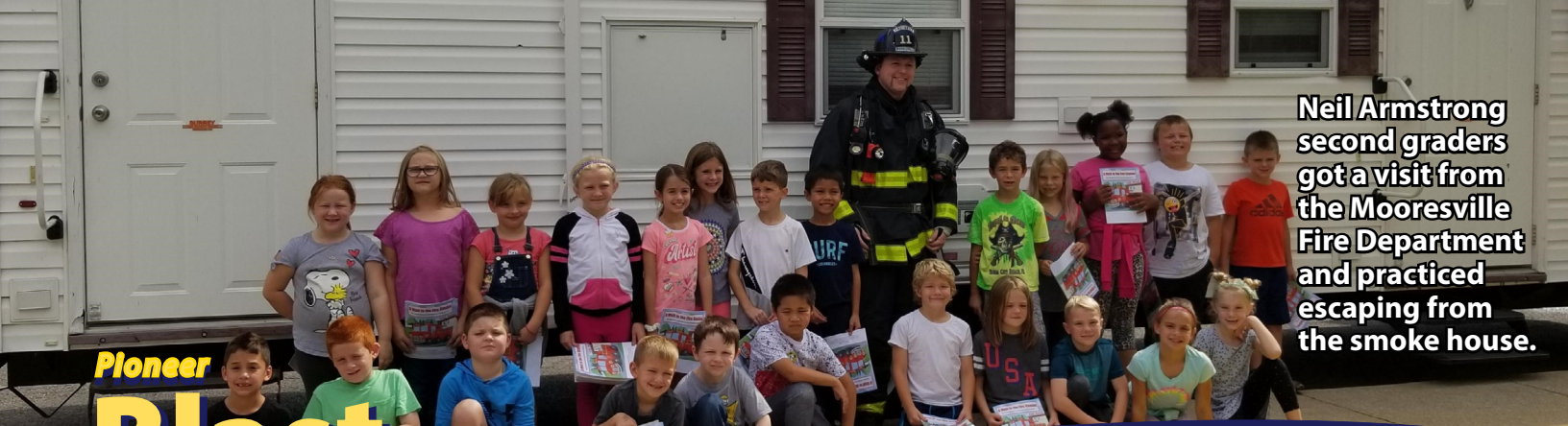
Neil Armstrong second graders got a visit from the Mooresville Fire Department and practiced escaping from the smoke house.