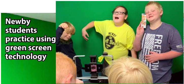
Newby students practice using green screen technology